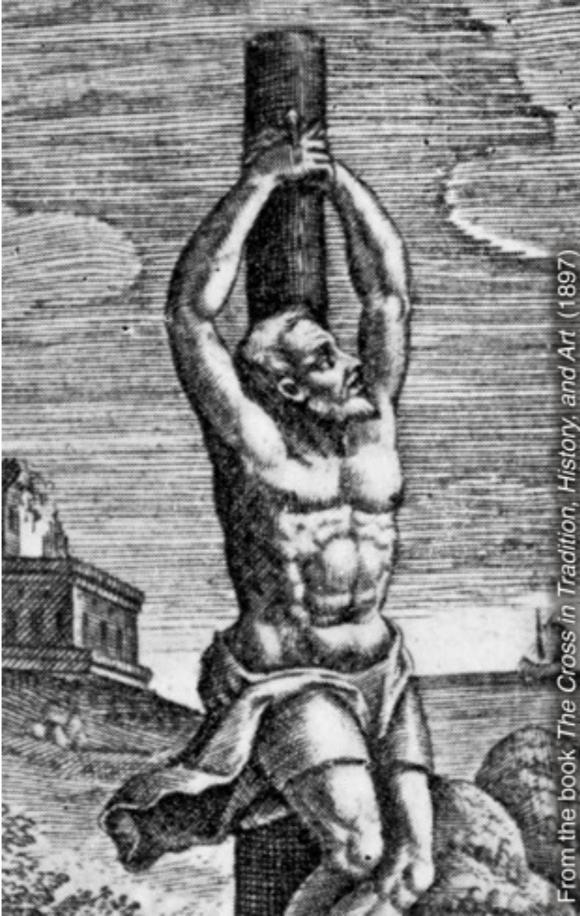
From the book The Cross in Tradition, History, and Art (1897)